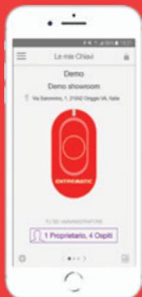
SCLAK iOS 9 application + and Android 4.3.1+

(2) Download the SCLAK App from the Apple or Google stores