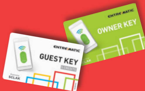
owner and guest credentials

(3) Follow the instructions in the App: activate the card and appoint an administrator/owner of the installation. If more access credentials are necessary, Entrematic cards with additional activation codes are available